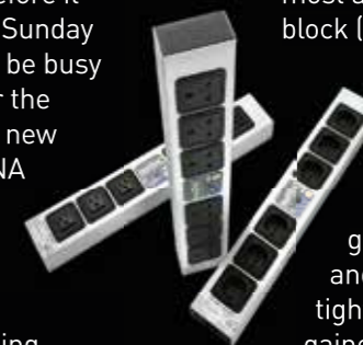
Above: IsoTek EVO3 Polaris six-way mains block

Of course, alongside all the hard work there was time for some more relaxed networking, including a backstage visit to Cirque du Soleil's Beatles LOVE spectacular. Las Vegas, or 'Lost Wages' as some might prefer to rename it, lived up to its billing once again. An extraordinary event in an extraordinary town: full on, fascinating and inspiring... but boy, it's great to be back in Blighty! ☺