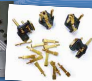
24ct gold-plated OFC conductors