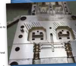
Bespoke BS1363 tooling