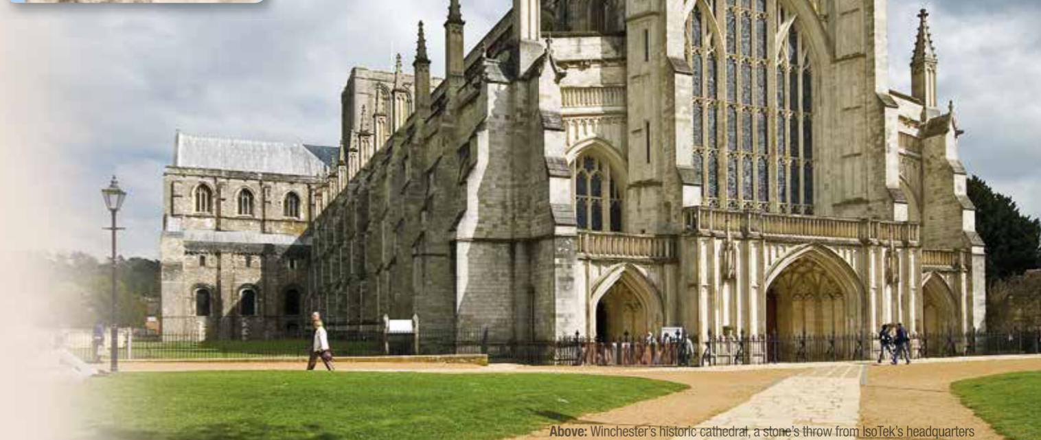
Above: Winchester's historic cathedral, a stone's throw from IsoTek's headquarters

> symmetrical signal path; Direct Coupled Design, which ensures optimal high-current filtering; Adaptive Gating, which tailors the filtering to suit each piece of equipment to perfection; and Polaris-X, which reduces crosstalk and improves component-from-component isolation. These have helped to earn IsoTek an unrivalled reputation among hi-fi critics, retailers and end-users alike, not to mention many well-known manufacturers of audio electronics and speakers who use our products for development and demonstration purposes.