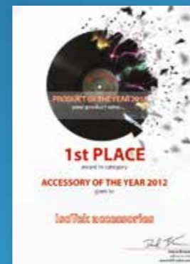
Another Award for IsoTek!

"We are always delighted when our products receive recognition in the international audio press. This award is particularly special because the readers of Hi-Fi Voice have determined the result. It's the views of those who buy and use our products that really count, so it's hugely gratifying that IsoTek products have been voted Accessory of the Year."