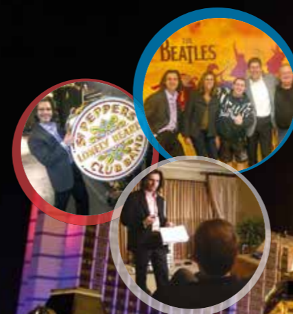
Above: Work, play (and very little rest) in Las Vegas!